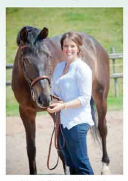
Ironman & Katle Barkhouse